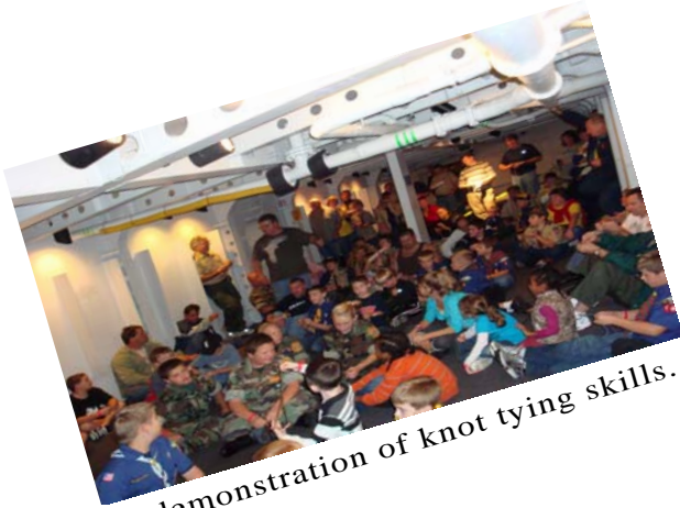
A demonstration of knot tying skills.

Cub Scout Pack 377 was established in 1966. We are sponsored by Wilson Rite American Legion #432. We are located in Setauket, NY and have 35+ boys actively participating in our program. The philosophy and approach for the pack is to keep the "outing" in Scouting! We pride ourselves on a year long program and maintain a