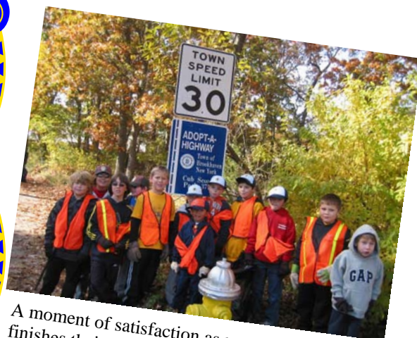
A moment of satisfaction as members of Pack 377 finishes their Adopt-A-Highway assignment.

For the record, Pack 377’s events is a record of what Cub Scouting can bring to a youngster. Besides the usual Blue & Gold Banquet and Pinewood Derby, there is a clearly a commitment to service. Pack 377 and its dens