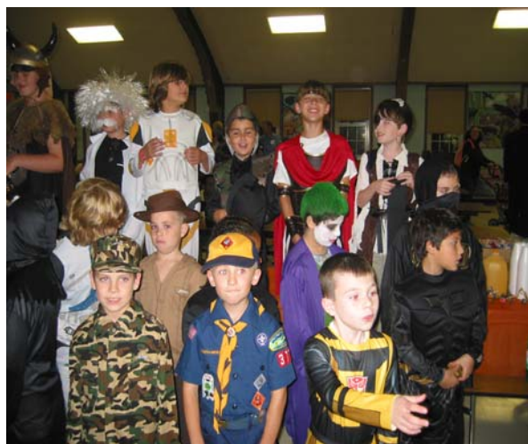
Boys just wanting to have fun! Halloween 2009.

they set their sights on the Presidential Service Award. Currently we are putting together a pilot program (proof of concept) in conjunction with some local members of the USAT (US Triathlon Association) to design an age specific tri-